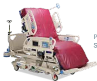
Progressa Smart+ Bed