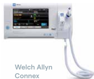
Welch Allyn Connex Spot Monitor