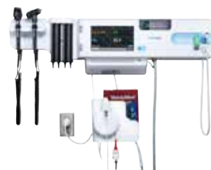
Welch Allyn Connex Integrated Wall System