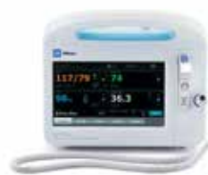
Welch Allyn Connex Vital Signs Monitor