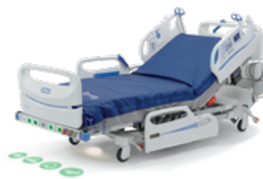
Centrella Smart+ Bed