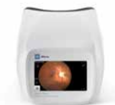
Welch Allyn RetinaVue 700 Imager